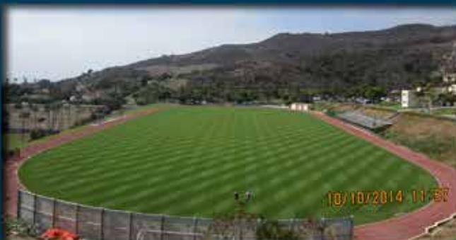
Pepperdine Soccer Field